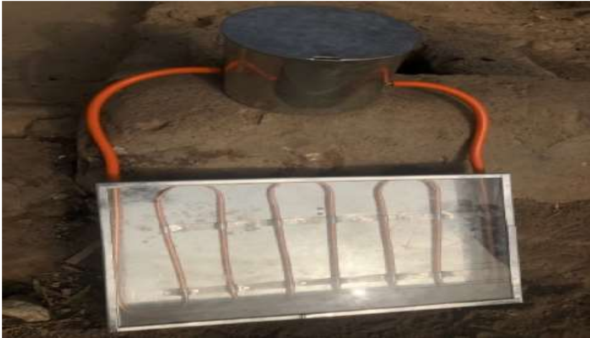
Figure 2: Solar Water Heater